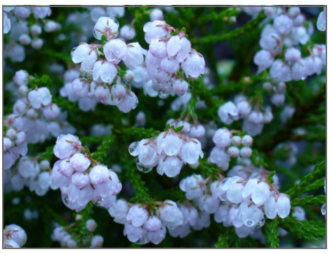
Erica capensis flower

Last year we had a wonderful team of volunteers who were kind enough to give up their time to help bring the border back to life. With a dig-dig here and a snip-snip there we tamed the border and now with donated plants and bulbs we are looking forward to seeing a display of colour.