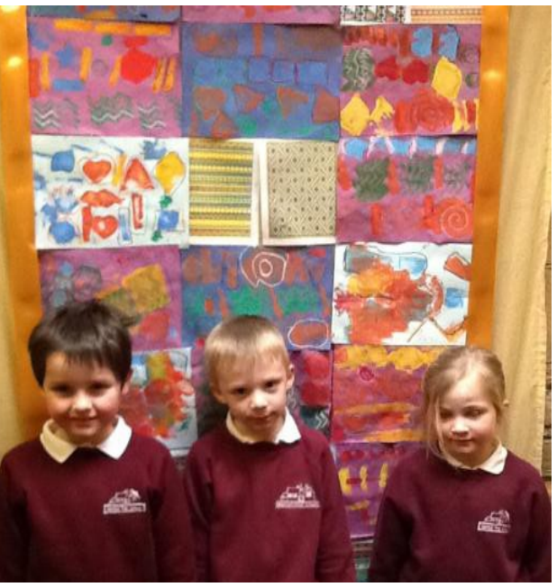
Reception pupils with their colourful African art

Later in the term, Year 4 were invited to Wells Cathedral by the Diocese of Bath and Wells for a First Schools Cathedral Day. The theme for the event was 'pilgrimage' and the children had an opportunity to study pilgrimage and journeys during workshops at the cathedral. The day began and ended with a service in the cathedral.